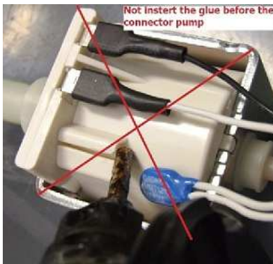
Warning: the glue must not be placed inside the seat, between the body of the pump and the body of the thermal protector (see Pict. 4)