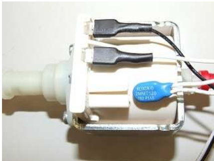
Insert thermal protector in the seat on the pump (Pict. 1)

To avoid that during the transport or the use of the machine the thermal protector slips off the pump seat (damaging the pump) we have introduced the fixing of the thermal protector with glue in the back side of the seat.