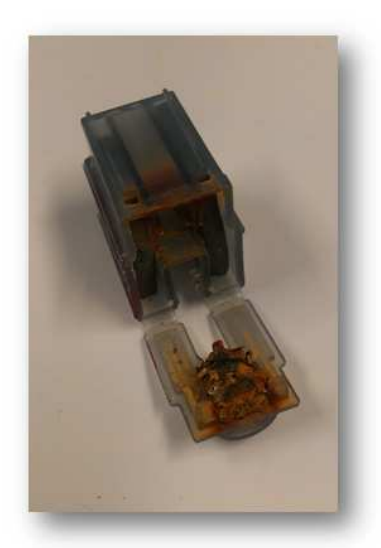
CURE: Replace the watercontainer