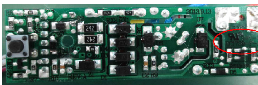
Generation 2 Power PCB 996510073641 Identification (Printed with EC1739-P-21 on the PCBA)