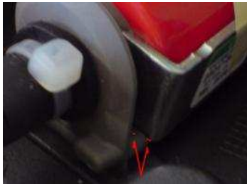
Make sure the dampers are installed correctly, per example, picture below is not OK!

Make sure the pump is placed level, per example, picture below is not OK! Pump is touching damper and base housing