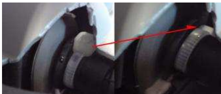
17-05-2011 Added possibility of boiler mount snapping off, when the appliance is transported or roughly handled with a full boiler.